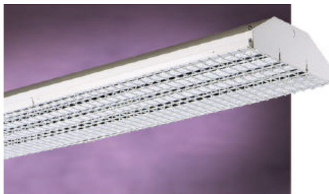
Shown with optional wireguard.